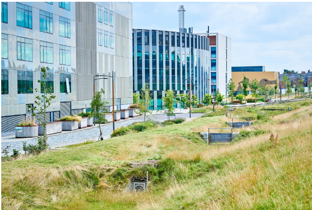
Image: Swale and other green infrastructure at the National Green Infrastructure Facility facility on the Helix campus, Newcastle University.